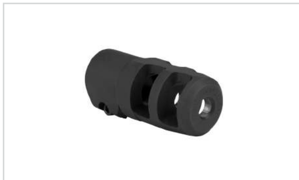
BADGER ORDINANCE FTE MUZZLE BRAKE (REMOVABLE)