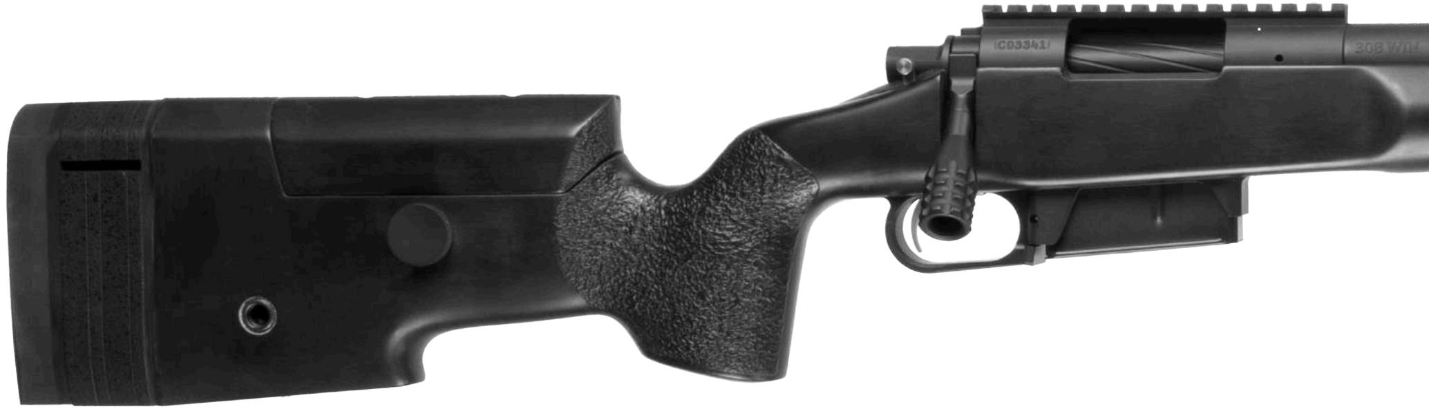
SURGEON SCALPEL .300 WIN, MCMILLAN A5 STOCK

WHEN HIGH-QUALITY COMPONENTS ARE COMBINED WITH THE MOST ADVANCED PROCESSES AVAILABLE, THE RESULT IS THE MOST ACCURATE RIFLES IN THE INDUSTRY!