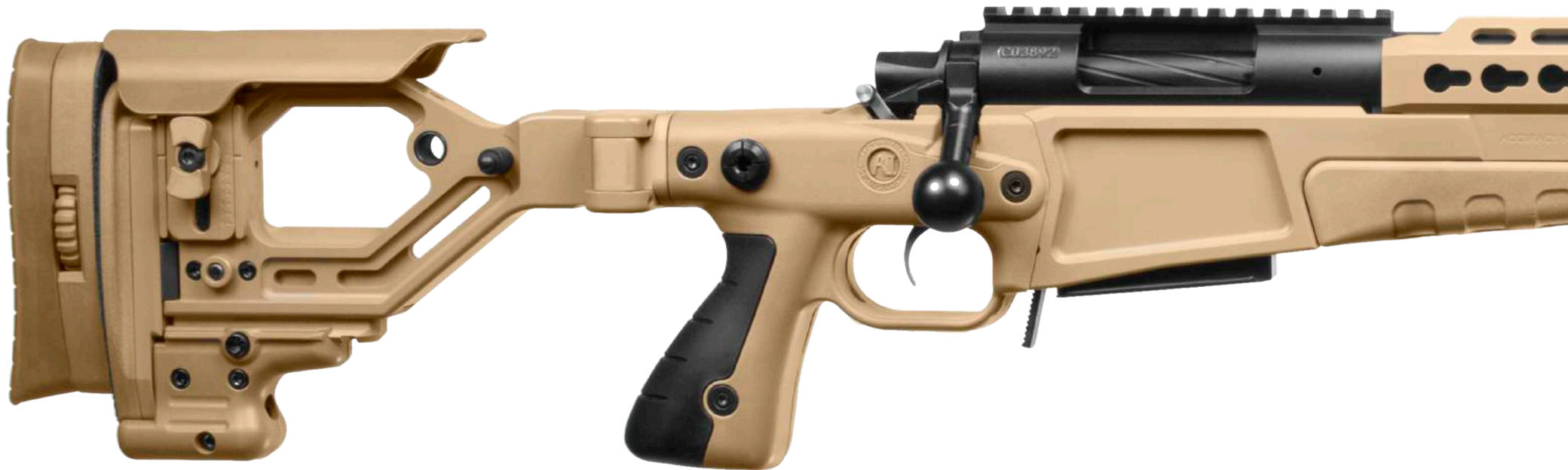
SURGEON SCALPEL .308 WIN, AXAICS CHASSIS