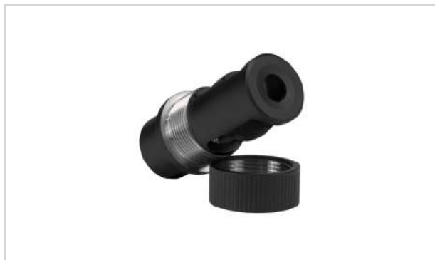
SURGEON PSR BRAKE