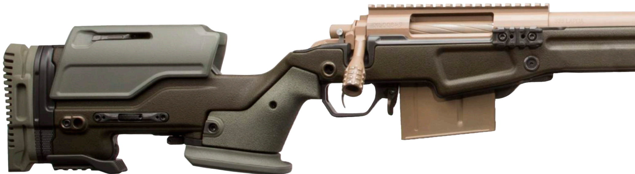
SURGEON REMEDY .338 LAPUA, JAE-700